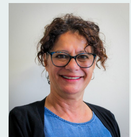
KAITAIA SERVICE COORDINATOR